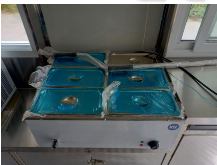
- Bain Marie -