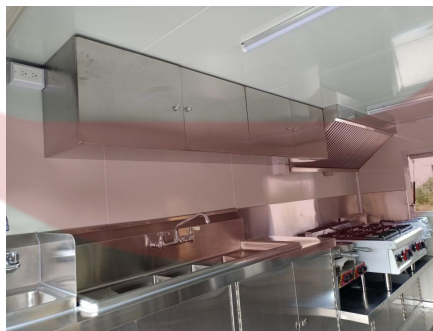
- Inside -