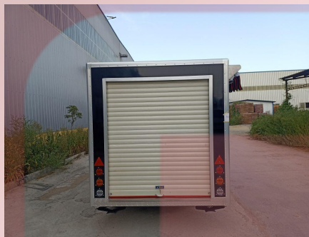
- Door -