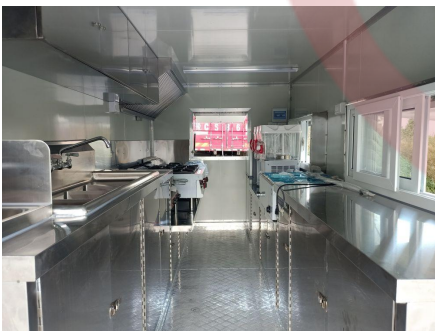
- Inside -