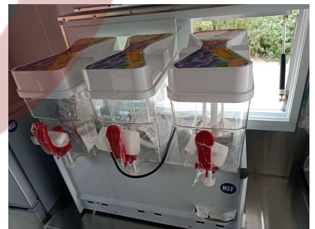
- Juice Dispensers -