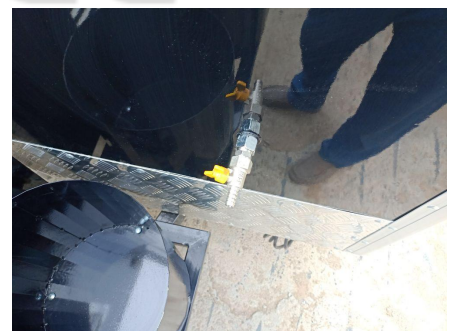
- Gas Valve -